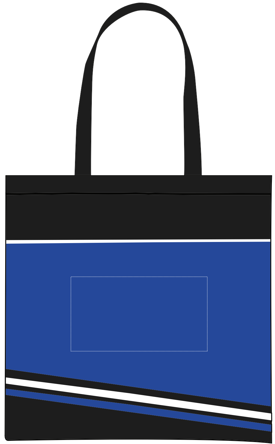
COMPOSITE NOT ACTUAL SIZE

Dashed Line For Imprint Area Only, Will Not Print.