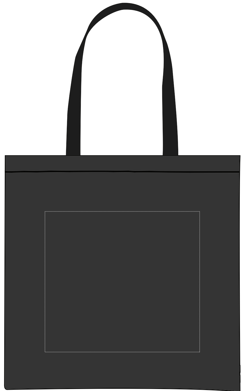
COMPOSITE NOT ACTUAL SIZE

Dashed Line For Imprint Area Only, Will Not Print.