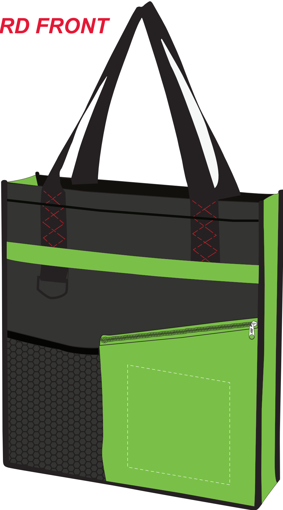
COMPOSITE NOT ACTUAL SIZE