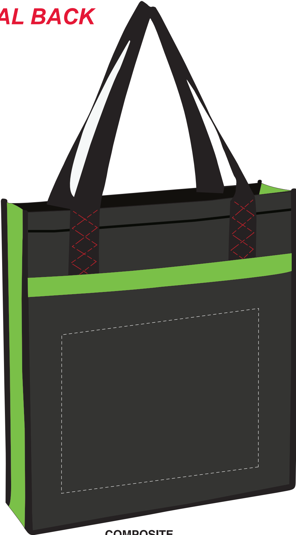
COMPOSITE NOT ACTUAL SIZE

3356 F.P.O. This is 50% smaller then actual imprint size