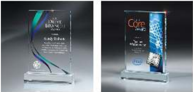
CATALOG SAMPLE ART