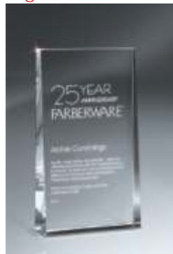
CATALOG SAMPLE ART

Digi-Color available. For Digi-Color option add "DC" prefix to item number